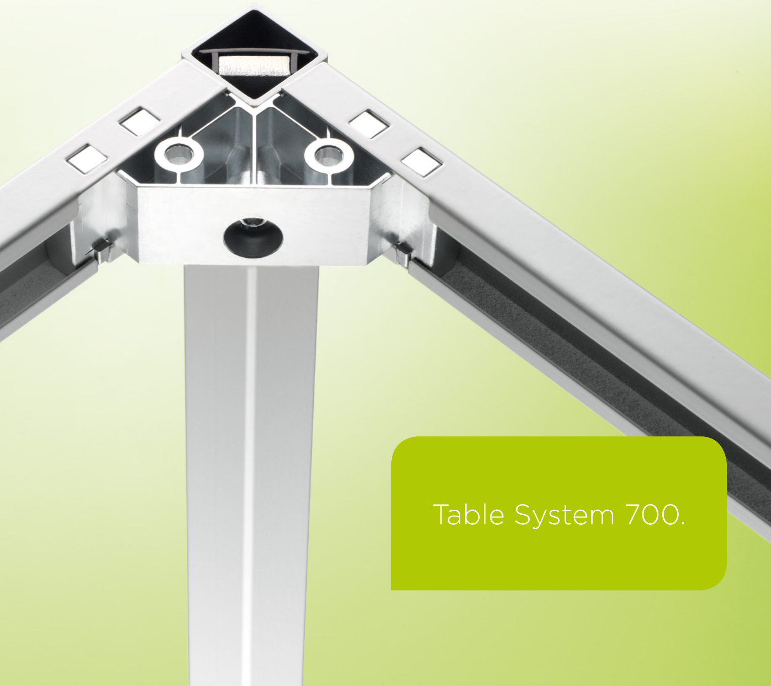
Table System 700.