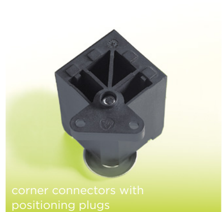
corner connectors with positioning plugs