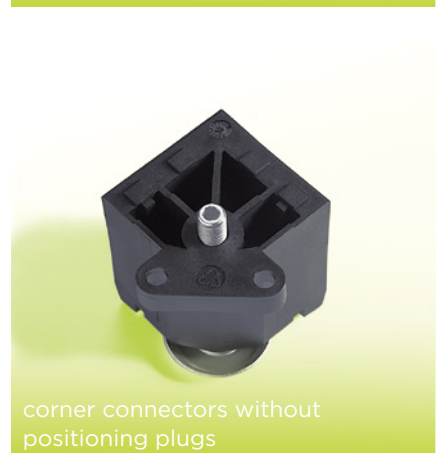
corner connectors without positioning plugs

The corner connectors come in various versions, with or without positioning plugs.